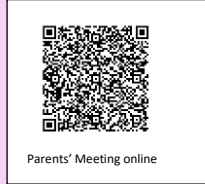
Parents' Meeting online

Thursday 29 th June 1 – 2.30pm Homemade café @ Forest Recreation Ground Thursday 13 th July 6.30 – 8pm on Microsoft Teams Scan the QR code to join or click the link Parent's coffee meeting online