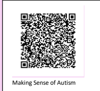
Making Sense of Autism

Wednesday 7 th June 6.30 - 8pm on Microsoft Teams Scan the QR code to join or click the link Making Sense of Autism for Parents