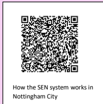
How the SEN system works in Nottingham City

Thursday 6 th July 10 – 11.30am on Microsoft Teams Scan the QR code to join or click the link How the SEN system works in Nottingham City