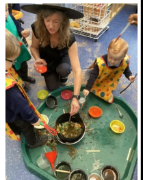
Making witch's potions, smelling the different ingredients.