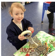
Looking at animal prints.

Last half term, the children and staff enjoyed our animals topic. We had lots of fun learning all about different animals in exciting and practical ways. We listened to lots of different animal sounds and tried to guess which animals they were, we made our own animal models and masks, learned about what different animals eat and where they live, and we listened to the song 'Carnival of the animals', having fun pretending to be the different animals, moving around like them.