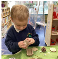
Making a bird's nest.